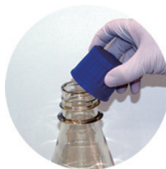
Add DuoCAP™ for Anaerobic Culture