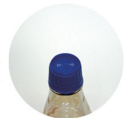
Move to Shaker Incubator