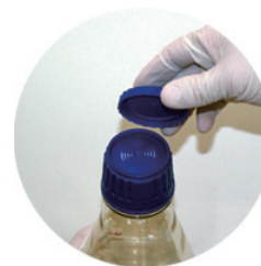
Remove dustguard cover for Aerobic Culture